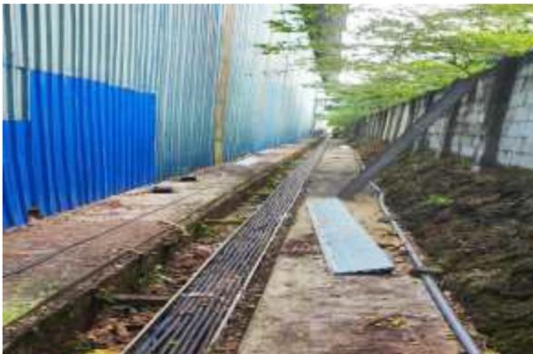
Pulling power cables, and installing cable trays at LINTECH SEASIDE FACILITY (LSF) PACIRAN LAMONGAN

PT. LINTECH DUTA PRATAMA has the capability to design electrical power distribution, MCC and control panel, electrical power pulling, site electrical power and control installation, and final commissioning.