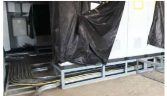
Pulling power cables, and installing cable trays at SIBELCO