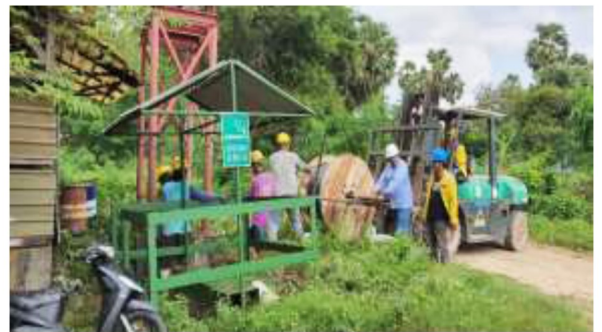
Pulling power cables at LINTECH SEASIDE FACILITY (LSF) PACIRAN LAMONGAN