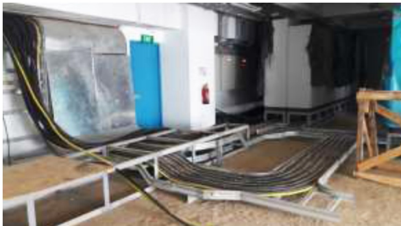
Pulling power cables, and installing cable trays at SIBELCO