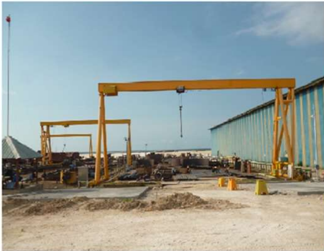
Portal Crane / Assembly Area 25 meter x 100 meter

The assembly process is carried out in the portal crane area which has 3 lines, and each is equipped with a crane with a capacity of 10 tons