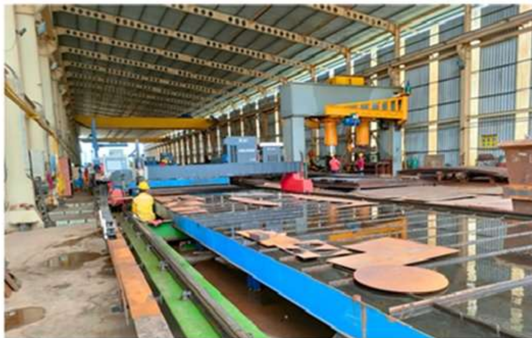
CNC Cutting Machine, Capacity 600 Tons Monthly

The process of cutting the plate is according to the working drawings and is carried out using a CNC cutting machine