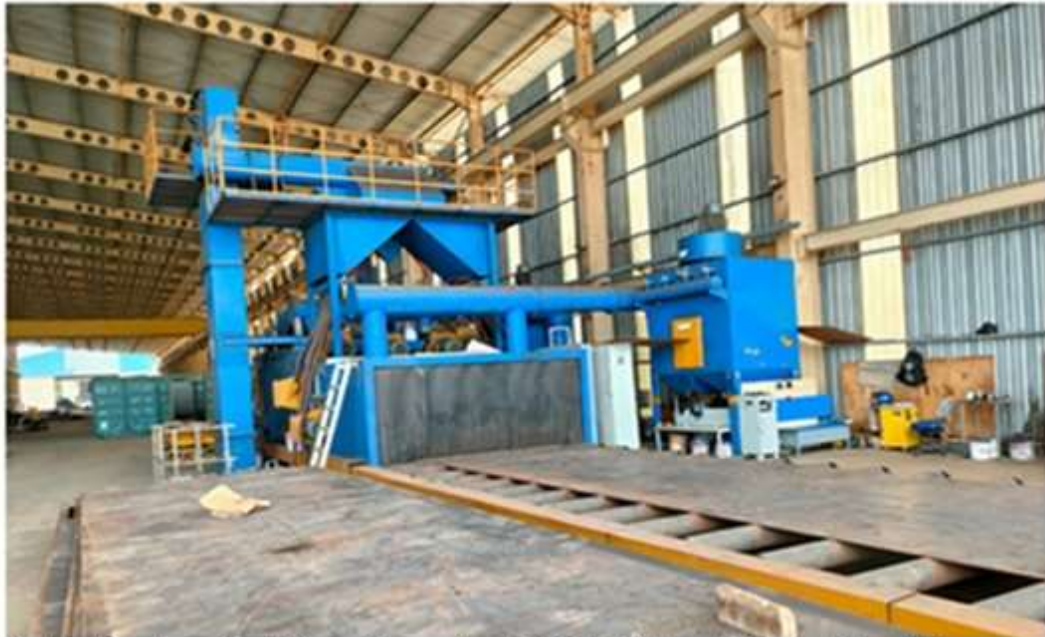
Auto Blasting Machine, Capacity 120-150 Sheet Plate Monthly

After all materials are recorded, both dimensions and certificates. The next process is the material is blasted and primary painting is carried out